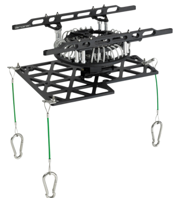
DJI Matrice 600